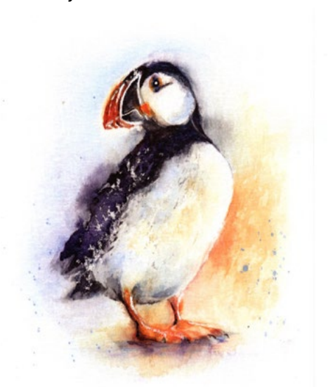
Jennifer Foulds: Puffin Billy

SG9 9LJ to view—and perhaps even purchase—some inspiring artwork.