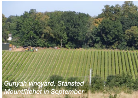
Gunyah vineyard, Stansted Mountfitchet in September

Another vineyard has appeared in recent years in Henham – and there may be others. Please email hundredparishes@btinternet.com if you find any more.