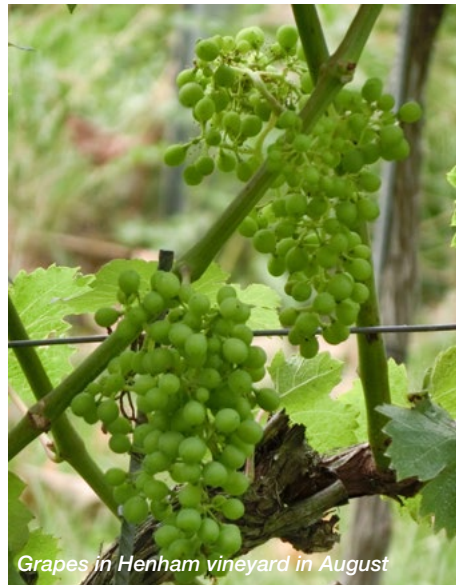
Grapes in Henham vineyard in August