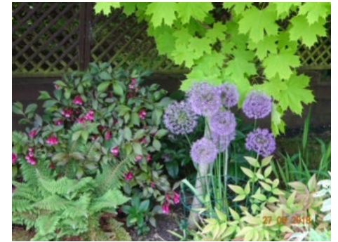
Alliums, Weigela, Fern, Nandina and Acer

Many plants have developed their own resistance to slugs and other leaf munchers. Some like foxgloves and euphorbias have toxic leaves whilst others like Stachys and Pulmonaria have developed thick course hairy leaves which slugs