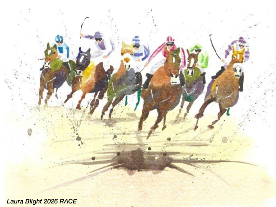
Laura Blight 2026 RACE