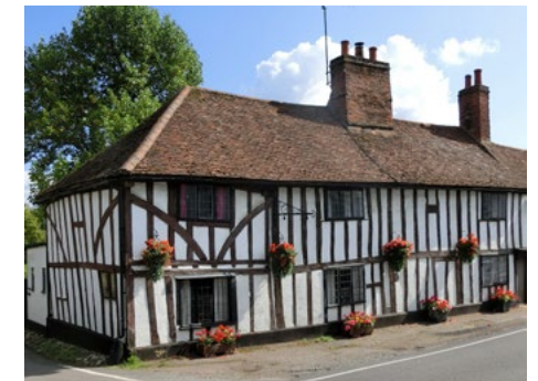
Vine Cottage, Much Hadham

Editor's Note: Of course as many of you will know we have our very own Vineyard here in Little Hadham at Four Acres Estate: www.fouracresestate.co.uk . Four Acres Estate is a family owned and run vineyard, orchard and winery producing fabulous English sparkling wine and delicious country cider pressed from traditional apple varieties, all grown right here in Little Hadham.