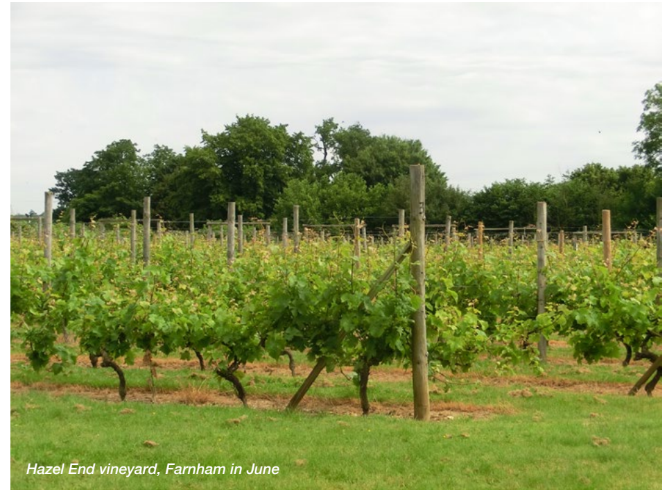
Hazel End vineyard, Farnham in June