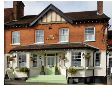
The Vine pub in Great Bardfield