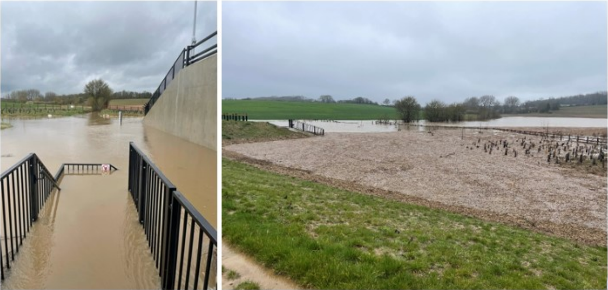
Water held back in the River Ash reservoir following the storm overnight on 31st March - 1st April 2023.

surface water from Little Hadham on six occasions during this winter season, and at the same time the Lloyd Taylor Drain diversion channel diverted river waters away from properties in Lloyd Taylor Close and beside Standon Road. The most significant of these events was at the very end of March when both the Albury Tributary and River Ash reservoirs held back a significant volume of water, this almost reaching one-third of the available storage height behind the embankments. Without the scheme being in place river flooding of properties in the village would very likely have occurred.